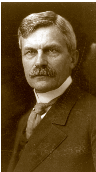
Charles Nagel, United States Secretary of Commerce and Labor and founder of the United States Chamber of Commerce.