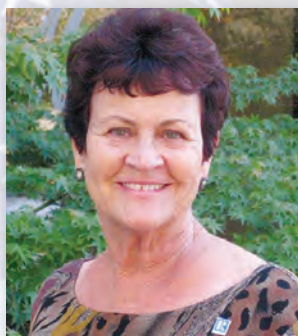
Associate Broker BRE Lic#00748546

The Portable Battery Program is administered by the following five Low-Income Home Energy Assistance Program (LIHEAP) providers: Butte Community Action Agency, Central