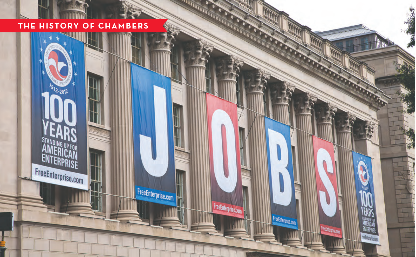
The U.S. Chamber of Commerce building in Washington, D.C.

From building your brand's presence to increasing sales, learn how you can use your membership to foster your company's growth.