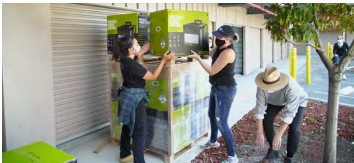
MCE staff unload batteries for distribution to medically vulnerable customers in July, 2020

MCE's customer programs increase access to clean energy technologies and resources while improving the lives of our customers. Our energy efficiency programs focus on increasing the health and safety of homes and businesses while reducing customer bills. During the COVID-19 pandemic, MCE implemented several programs and policies to better serve customers including suspension of collections activities , new web pages dedicated to providing COVID relief resources, and a bill credit program supporting our most vulnerable residential and small business customers.