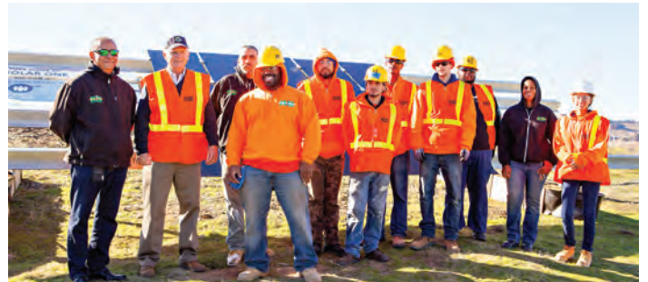
RichmondBUILD team at MCE Solar One in Richmond, CA

MCE's Sustainable Workforce and Diversity Policy focuses on creating opportunities to build a clean energy workforce and foster local economic growth. MCE partners closely with local workforce development agencies and union labor including the Rising Sun Center for Opportunity, RichmondBUILD, and Future Build. MCE has utilized union labor for many of its renewable energy projects and recently signed a Project Labor Agreement with IBEW Local 302 in Contra Costa County. Our local renewable energy projects also require at least 50% of the workforce be from local residents and all employees must receive prevailing wage.