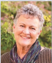
R Associate Broker DRE Lic#00748546

One idea led to another, and Village 360 was born. A place for the community that was missing in the valley. Somewhere people could grab a cup of coffee, a glass of their wine or a simple bite to eat. A place where "rushing around" doesn't exist, a place to sit back and take a minute to just be. One