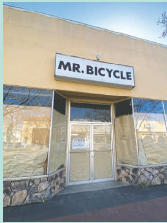
The old Mr. Bicycle building on West Texas Street will be the new home of the Bella Roma restaurant.

The city will start by making the zoning codes and application processes cheaper. Additionally, they want to streamline the process to make approval quicker. There is also an inventive package for commercial property owners known as the Facade Improvement Grant. “The City of Fairfield’s Facade, Outdoor Seating, and Signage Improvement Program is a 50/50 matching program designed to support businesses throughout the Heart of Fairfield Plan Area, providing the opportunity for property and business