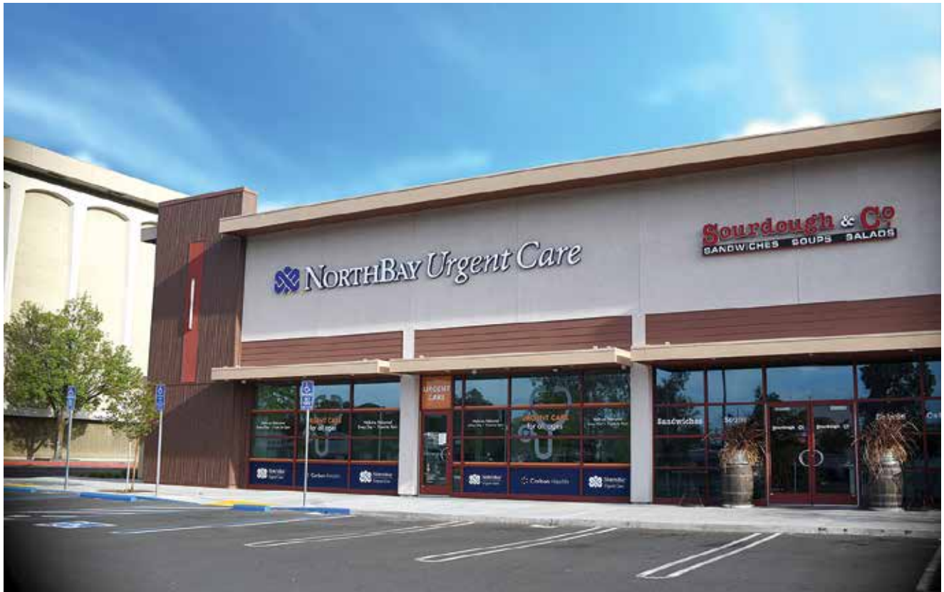
The NorthBay Urgent Care facility in Fairfield opened in February 2020 near the Solano Town Center mall.